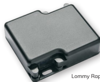
Lommy Rapid L