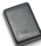
Lommy Rapid S

Choosing the option for Real-Time mode, enables you to receive ultra-high-speed positions in an interval down to a few seconds. Real-Time mode is supplied as a special add-on option.